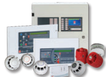
Addressable Fire Systems