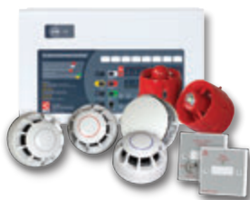
Conventional Fire Systems

In addition to the power supplies detailed in this brochure, we also manufacture the following:-