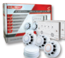
Domestic Fire Systems