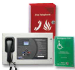
Disabled Refuge Systems