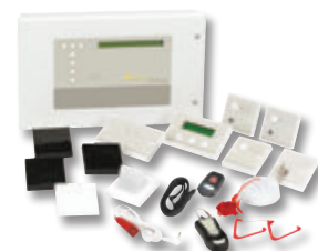
Addressable Call Systems