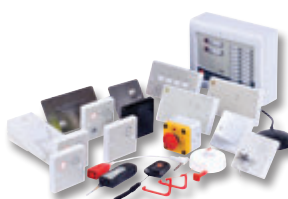
Conventional Call Systems